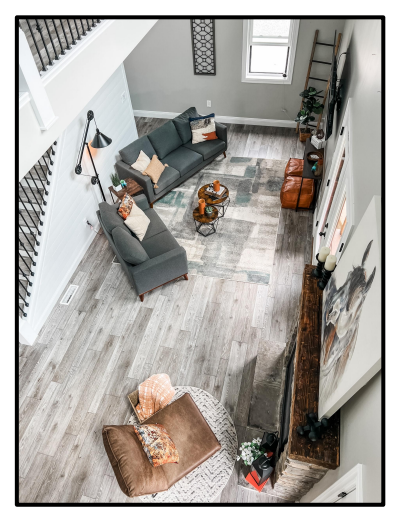
** Data from 2021 National Association of Realtor's Profile on Home Staging Report

So get this: A full... 85% of homes that were staged sold for 5-23% over list price!